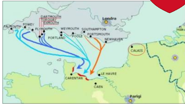
ZONE DELLO SBARCO - 1944 - D DAY