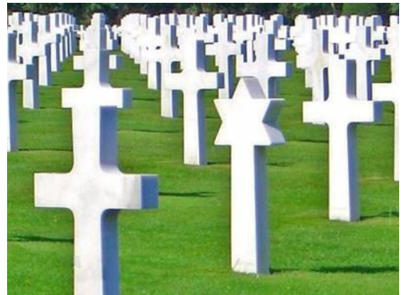
CIMITERO AMERICANO DI OMAHA BEACH