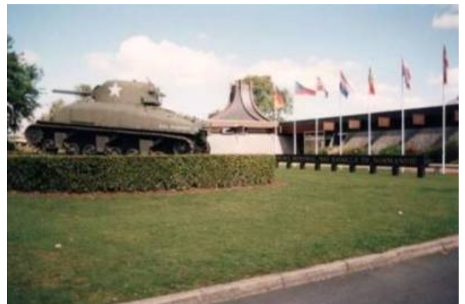
MUSEE MEMORIAL DE LA BATAILLE DE NORMANDIE A BAYEUX (La prima città francese liberata)